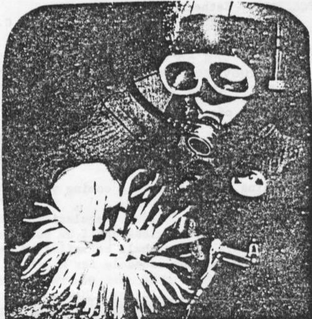
Diver at about 60 feet down examines a colourful anemone, one of many species found in local waters.